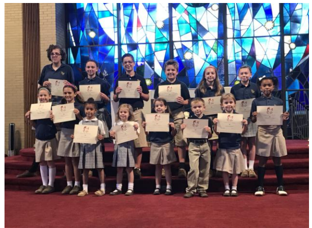
Students recognized at our First Friday Mass for the September Fruit of the Holy Spirit, love.